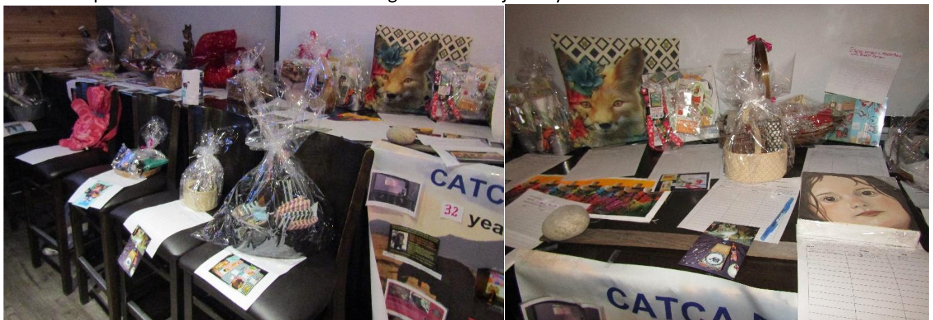
We had about 200 small items for the raffles and silent auctions!