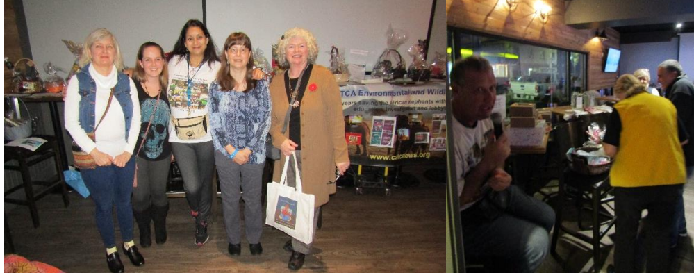
With our amazing friends that came to help us and support us!