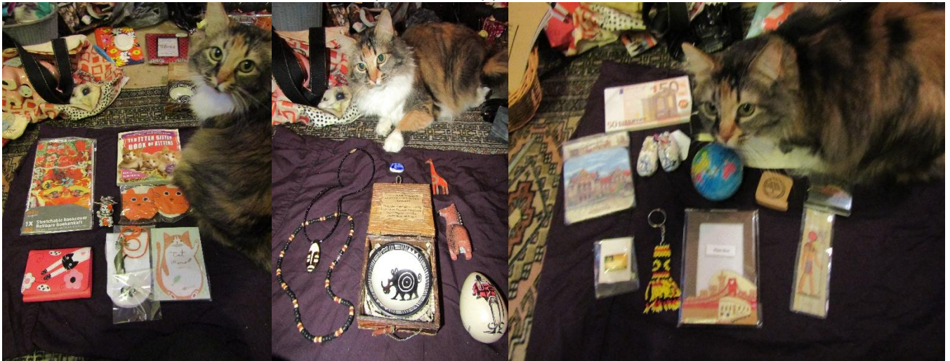
Even Tuni the cat did her share "helping" me by playing with the silent auction items 😊